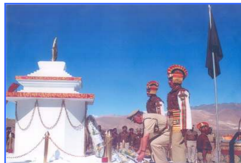
CRPF Jawans paying tribute at the memorial erected at Hot Spring, Ladakh