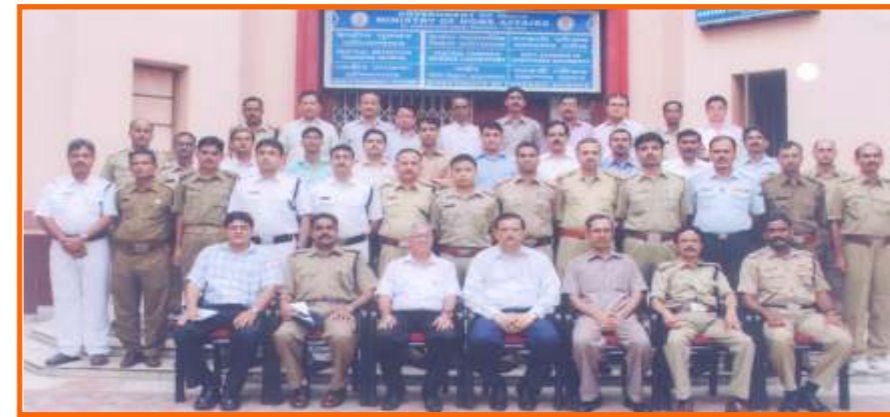
Participants of the course "Scientific Interrogation" held at CDTS, Kolkata.

Central Detective Training School (CDTS) Kolkata organized a five-day course on "Scientific Interrogation" from 14th to 18th Sept. 2009 at CDTS, Kolkata. Thirty nine Police Officers from different States/Units attended the training course. The course found to be very helpful for the Police Officers to deal with the cases in a very scientific way.