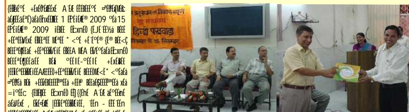
ब्यूरो में आयोजित हिन्दी पखवाड़े के समापन समारोह का दृश्य